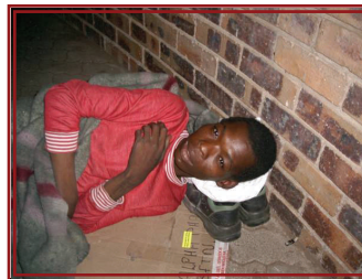
A Homeless child forced to sleep on the street.